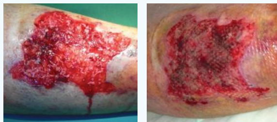
Figure 3: Small fragments of minced skin are demonstrated on the left and coalescing of the fragments is demonstrated on day 8 on the right.

ing and be protected from infection. Soaking the graft fragments with Vashe at each dressing change provides protection to them as they coalesce into a solid sheet of skin to complete closure of the wound (Fig.3)