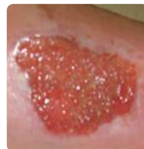
Day 14: post-treatment