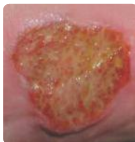
Day 0: pre-treatment

A typical example from the study is shown here 1 :