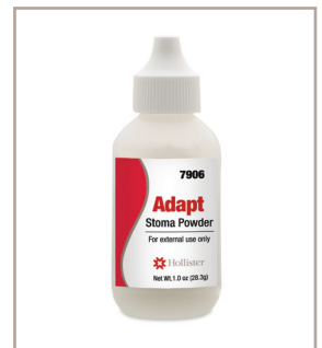
Adapt Stoma Powder Stock No 7906