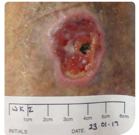
Figure B: Dressing change.