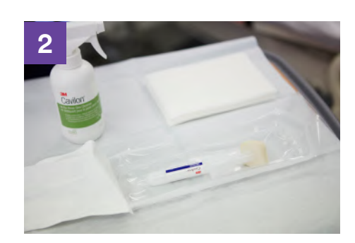
Open the package of Cavilon Advanced Skin Protectant and leave the applicator in the plastic pouch.