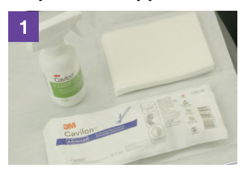
Set up your supplies on a clean surface.